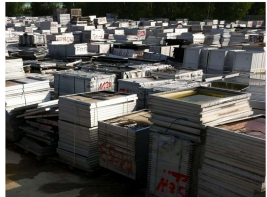
Figure 4. PV Panels Waiting to be Recycled

The Solar Energy Industries Association (SEIA) started the SEIA National PV Recycling Program several years ago at accelerate PV recycling in the US. Currently the program aggregates the services offered by recycling vendors and PV manufacturers, making it easier for the industry to select a cost-effective and environmentally responsible end-of-life management solution. The program identifies Preferred Recycling Partners through an evaluation process. These partners are capable of recycling PV modules, inverters, and other related equipment today. The current SEIA PV Recycling Partners are listed on the program’s website, and full access to the program and the Preferred Recycling Partners is available to SEIA members.