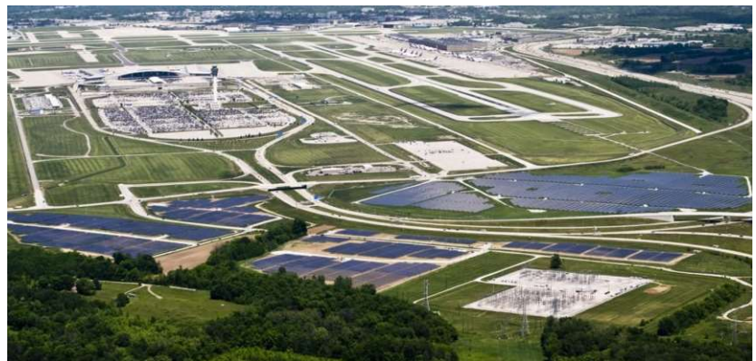
Figure 6. 20 MW PV System at Indianapolis International Airport

PV facilities, such as Wheelhouse Solar, that utilize single axis trackers to slowly rotate the solar panels to follow the sun have even less potential to create glare because the trackers help avoid a situation where sunlight hits the panels at a glancing angle. Most modern trackers implement an advanced control strategy known as "backtracking" that increases the electricity production of the site by flattening the tilt of the panels early and late in the day to keep the rows of solar panels from shading one another. Backtracking can result in brief periods near sunrise and sunset where the sun strikes the panels at a glancing angle, creating a situation that could result in a few minutes of visible glare at sunrise and sunset. For anyone to see this glare they must be looking across the solar panels in the direction of the rising or setting sun, which is a situation where the sun obviously will create significant glare for the viewer with or without the solar project.