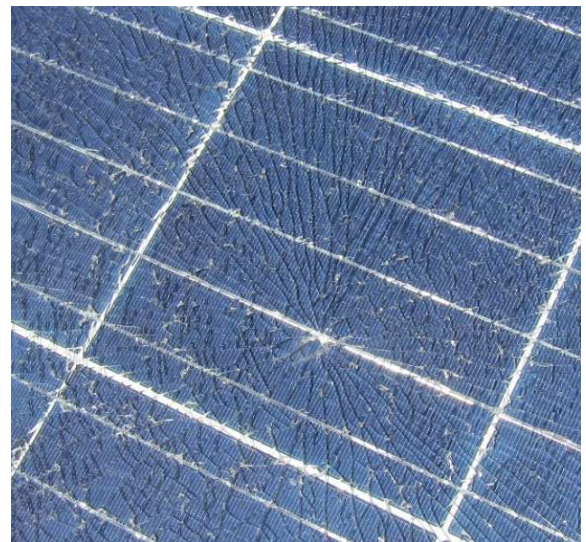
Figure 3. Close-up photo of impact point that broke the glass front of this PV panel

There is zero risk of toxicity escape from undamaged PV panels because any lead is sealed from air and water exposure. Individual panels damaged during the life of the solar facility are identified in days to months through either remote monitoring of system performance or from visual inspections during maintenance by onsite staff. Recently an international team of experts conducted an International Energy Agency - Photovoltaic Power Systems Programme (IEA-PVPS) study to assess if there is a public health hazard caused by lead leaching from the broken PV panels during the life of a utility-scale solar facility utilizing conservative assumptions to evaluate extreme scenarios. 10 The study examined worst-case exposure routes of soil, air, and ground water for a typical 100 MW AC PV facility. For example, the worst-case residential groundwater exposure assumed that all broken panels from the entire array were within 25 feet of the groundwater well, and the chemicals released from every broken panel transported to the same groundwater well. The study found that worst-case lead exposure via air, soil, and water were each orders of magnitude less than the maximum safe levels defined by the US