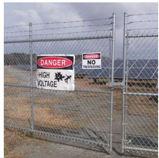
Figure 1. Perimeter Fence with Warning Signs

In circuits with significant available fault current there is another electrical hazard, called arc flash, which is an explosion of energy that can occur due to a short circuit. This explosive release of energy causes a flash of light and heat, and creates a shockwave that can knock someone off their feet. The risk of arc flash in a solar facility is no different than the risk at commercial or industrial buildings, except that solar facilities are much less accessible. Equipment with an arc flash risk require arc flash warning labels, and only trained personnel wearing the proper personal protective equipment are allowed to work on it. Due to the secure perimeter and the high U.S. electrical safety standards, there is extremely low arc flash risk to the public.