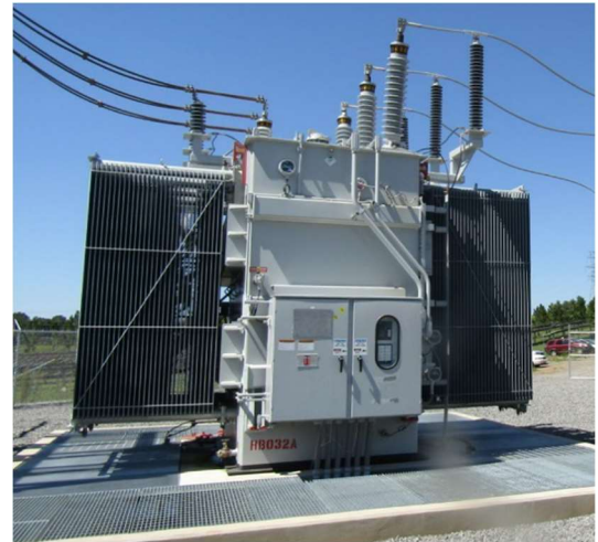
Figure 5. GSU Transformer with Secondary Containment to Capture any Leaked Oil